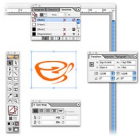
After: Palettes automatically group around selection.